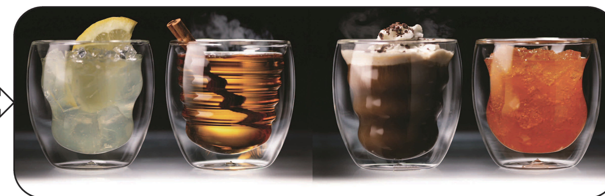
Perfect Double Wall Glass Cup