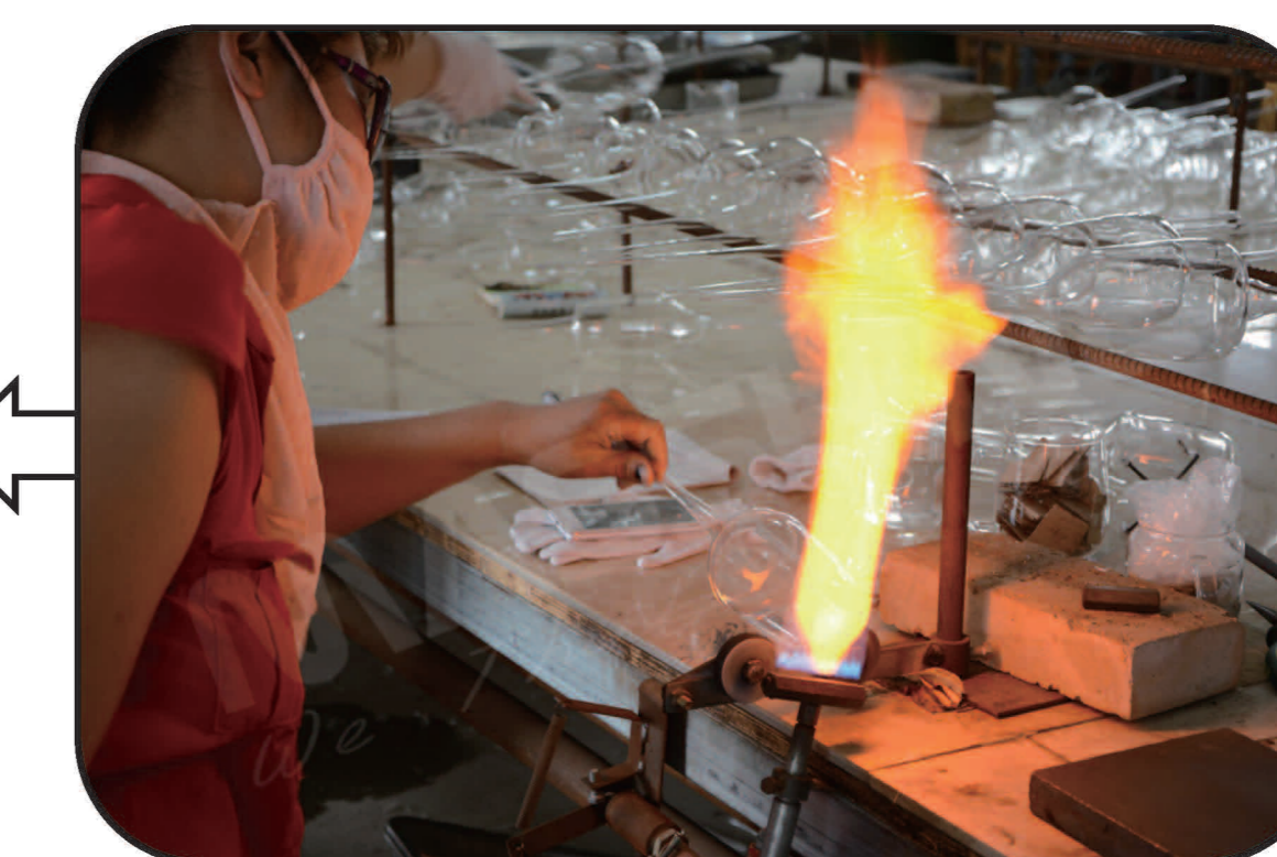
Blow the Outer layer Cup