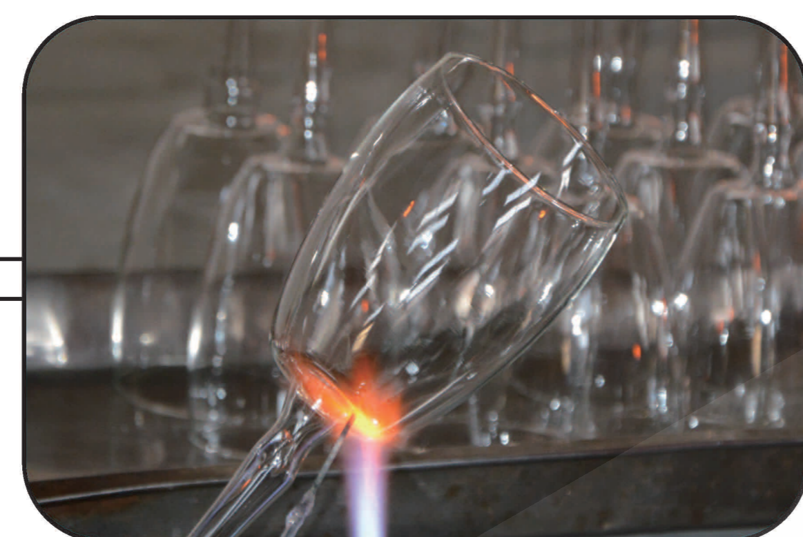
Prick Hole at the Bottom of Outer Cup