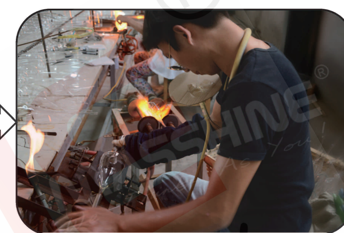
Blow the inner layer Cup