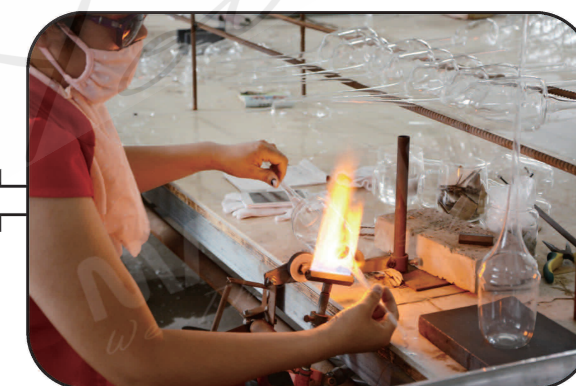
Blow the Outer layer Cup