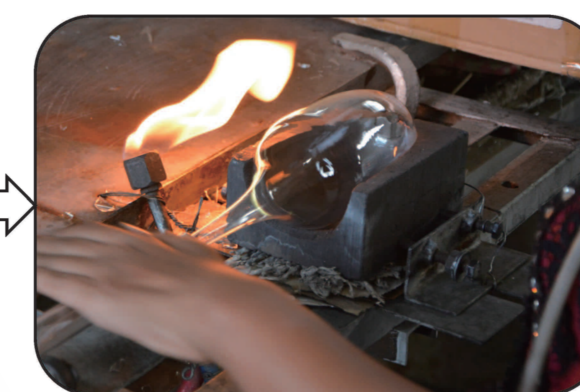
Blow the inner layer Cup