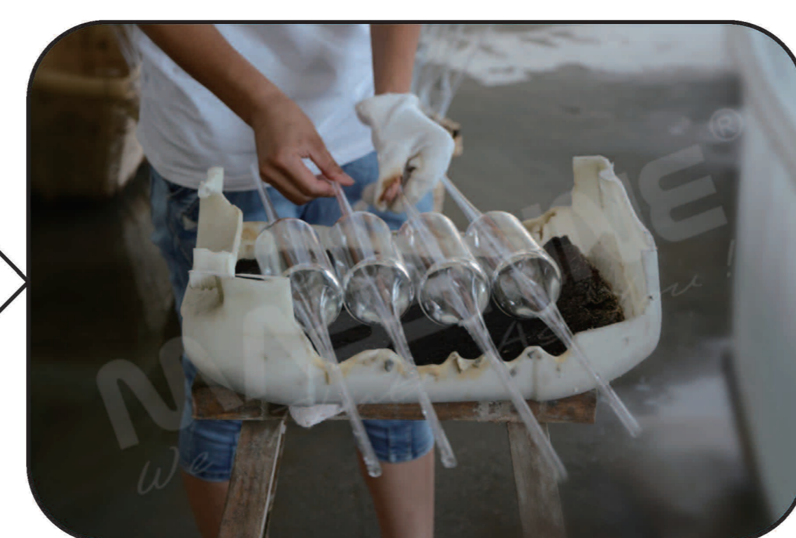
The 1st Clean