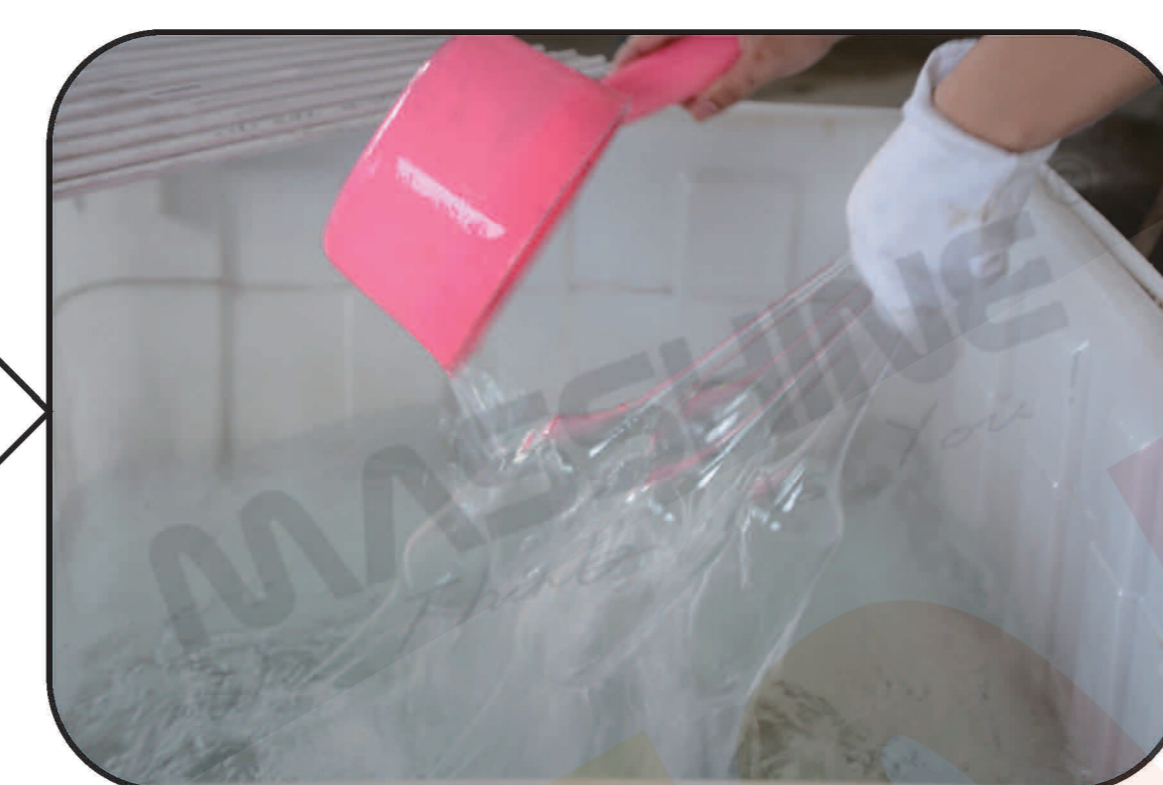
The 1st Clean