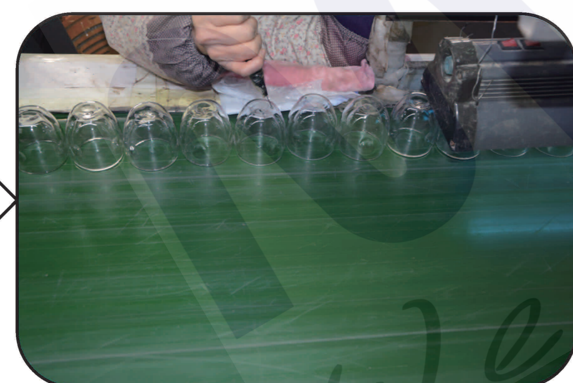
Sealing the Hole of Bottom