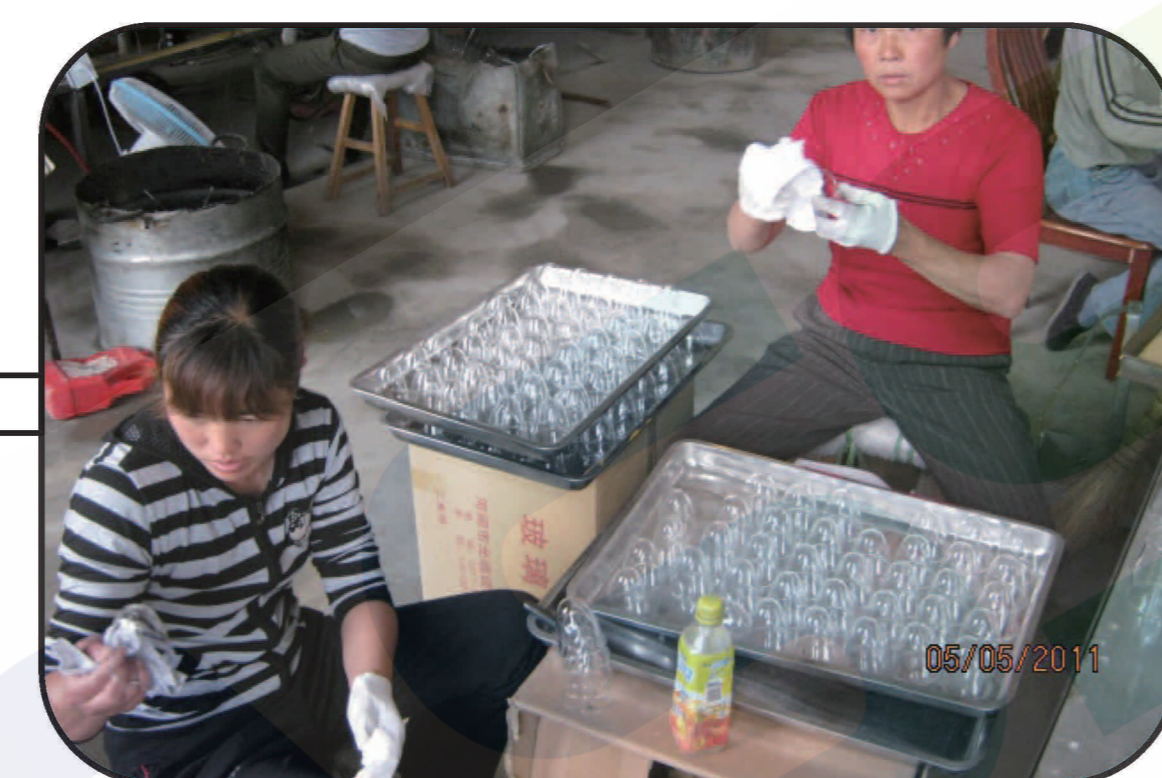
The 2nd Clean